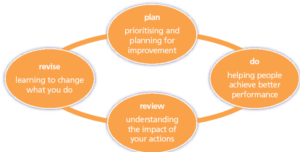
Diagram 2 – plan-do-review-revise cycle.

This can be summarised as the plan-do-review-revise cycle or the continuous cycle of improvement as demonstrated in the following diagram.